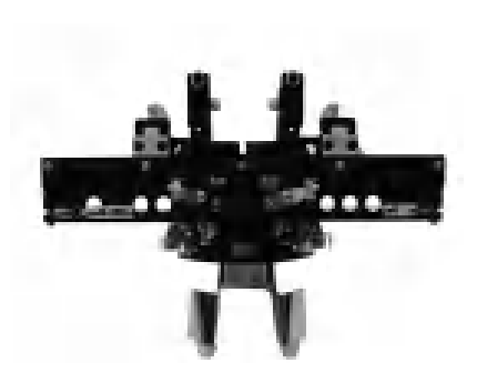
270° cap driver 1 set snaps into bracket holder for the machine hoops