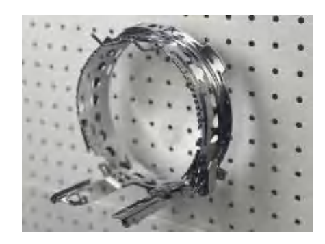
Cap rings 2 sets snap into cap stationfor embroidery preparation